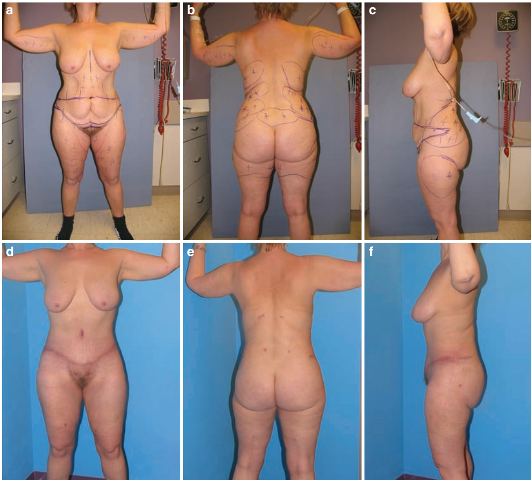
Figure 10.3. Combining body contouring with UAL. The before ( a, b, and c ) and 1 month ( d, e, and f ) after UAL (VASER) of the flanks, abdomen, and flanks with an extended abdominoplasty in a 44-year old, 148-lb woman.

I agree with this author's conclusion that the combination should be used not as a means to lose weight but as a surgical procedure that improves the body contour in patients with differing degrees of obesity.